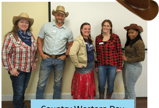
Country Western Day

Your dedicated staff truly love to show their OLOH Spirit!!!!