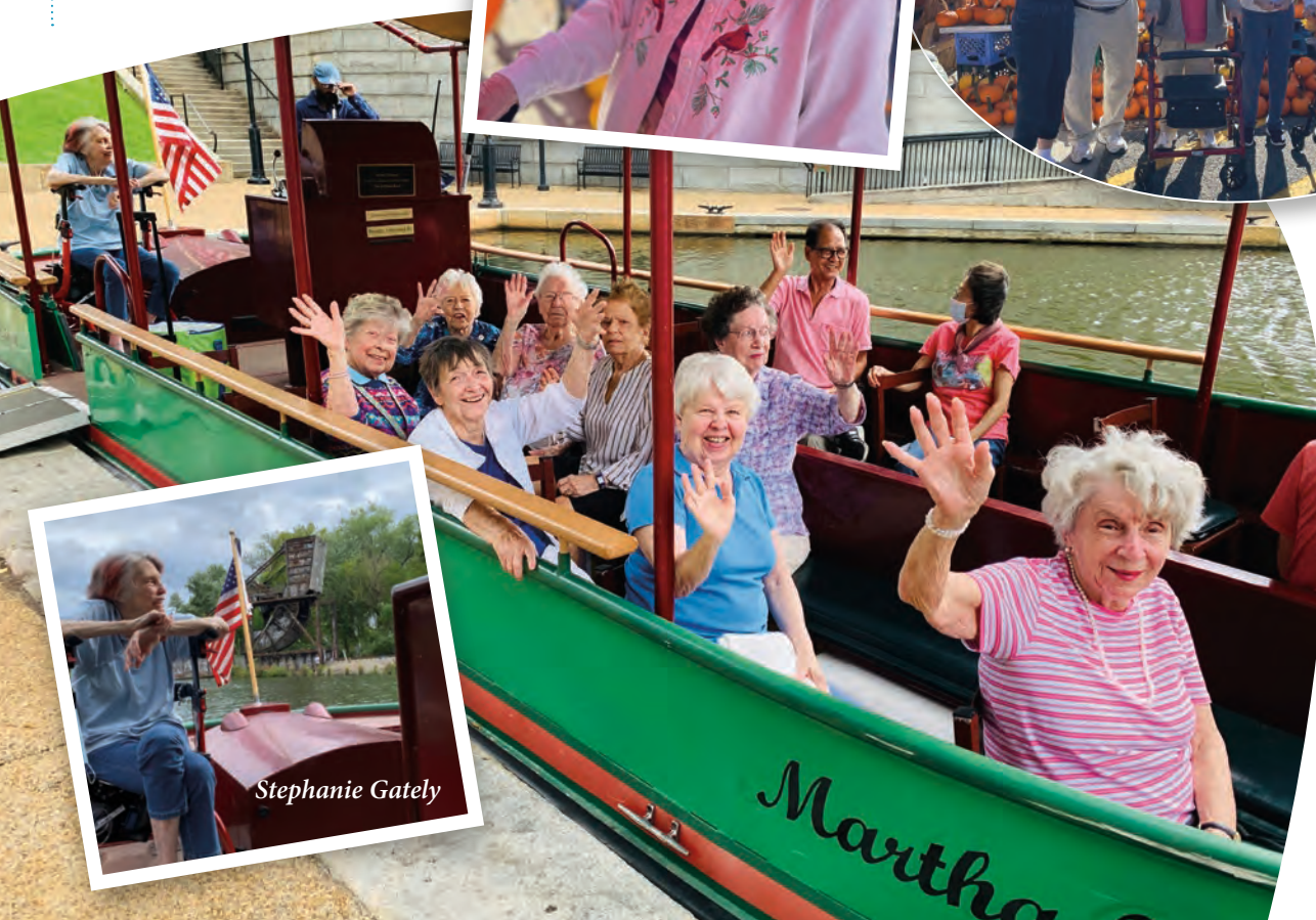
Great weather had residents smiling during the 40-minute, narrated boat tour that followed Richmond's historic Canal Walk.