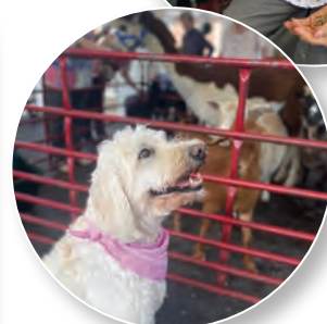
Folly makes some new furry friends, too!